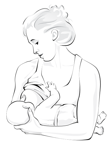
Courtesy of Breastfeeding Protocols for Health Care Providers Toronto Public Health

This allows the baby to comfortably latch onto your breast with a deep latch.