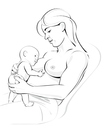
Courtesy of Breastfeeding Protocols for Health Care Providers Toronto Public Health